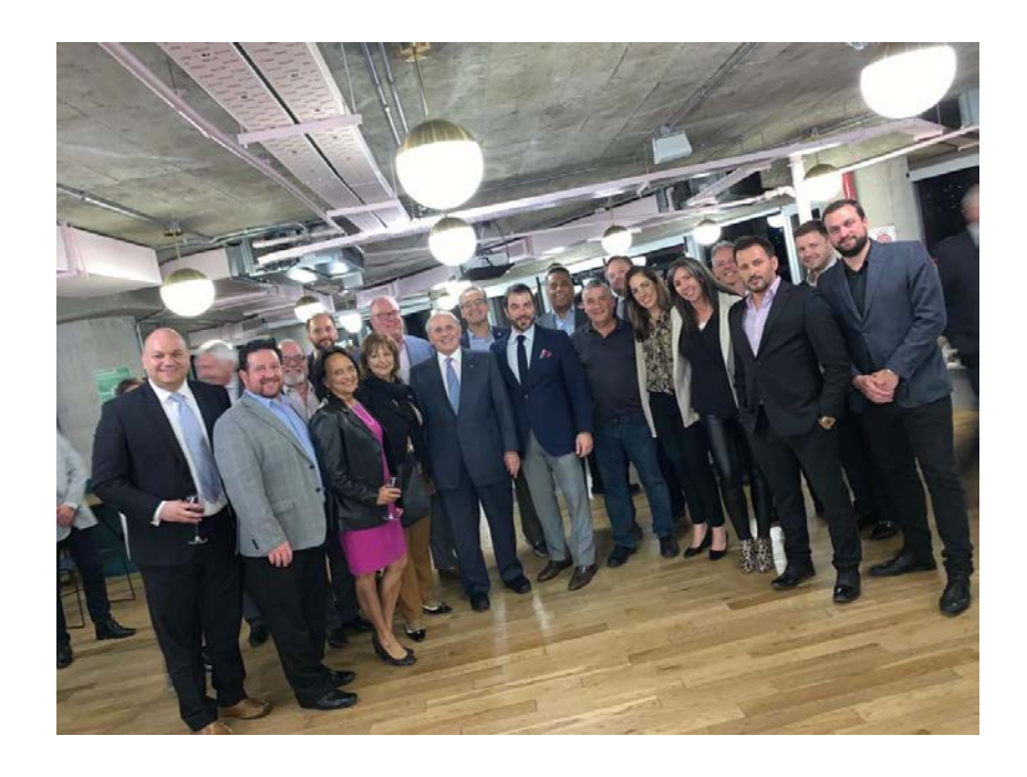
Fruitful day of meetings including a delegation of mayors to discuss developing SmartCity initiatives ended with this reception at WeWork Buenos Aires thanks to Balsera Communications

The evening concluded with a reception in the penthouse of WeWork, a 15-story building owned and operated by the coworking space company. Sixty business men and women attended the reception.