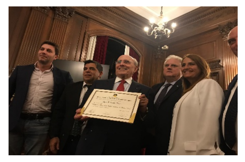
Mayor Raul Valdes-Fauli honored by the Legislature of Buenos Aires