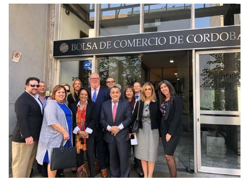
Meeting with Leadership of the Camara de Comercio Exterior de Córdoba and Agencia; Meeting with Leadership of the Camara de Comercio Exterior de Córdoba and Agencia ProCórdoba, the economic development agency

In the afternoon, the delegation met with senior officials in foreign relations who are in the middle of transitioning into leadership of the new administration. In Cordoba, it takes approximately 7 months to transition from one administration to another.