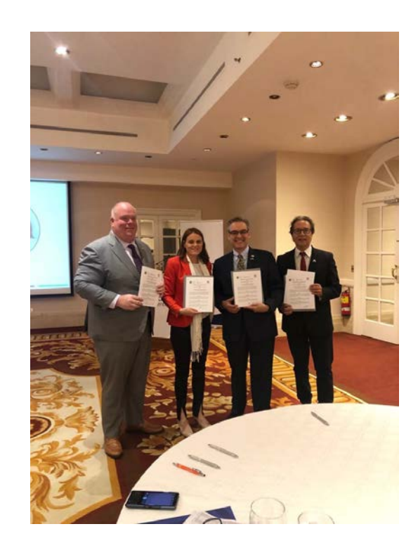
Signing of MOU with AmCham Buenos Aires

The group obtained an early morning briefing from the American Chamber of Commerce with an overview of trade and business opportunities. The briefing was attended by 55 Argentine companies from various sectors including professional services, trade and logistics, technology, communications, insurance and utilities/infrastructure – all interested in doing business in or with the Miami market. The morning concluded with the Coral Gables and Greater Miami Chambers of Commerce signing an MOU of cooperation with the American Chamber of Commerce of Argentina.