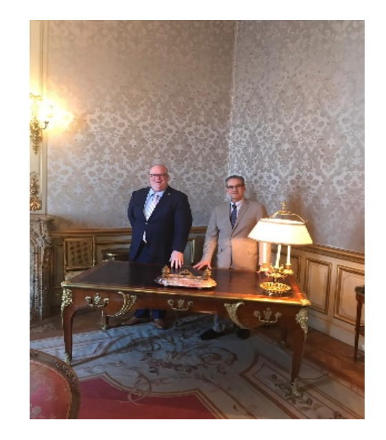
This desk was carried blocks away to the US Embassy for the signing of USMCA Treaty

We also were able to see where many state dinners and important meetings have occurred, including the signing of the USMCA treaty between US, Canada and Mexico. Pictured is the actual the desk where the treaty was signed.