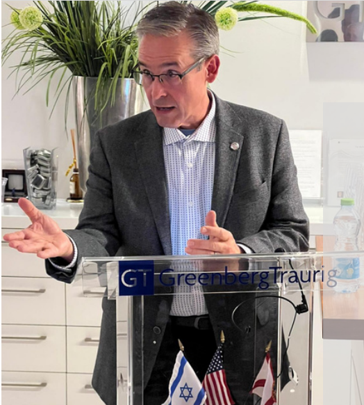
Greenberg Traurig hosted the delegation in the offices located in the incredible Azrieli Center.