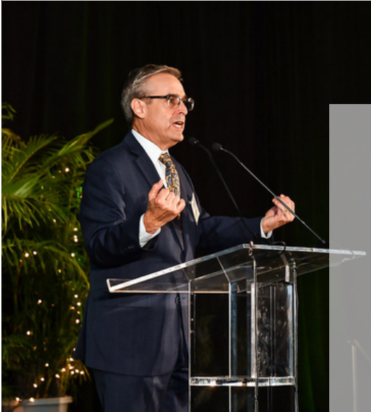
We said thanks to South Florida Health Care Heroes® and first responders on May 19.