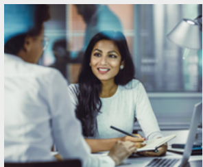
HR Webinar Series Part 3 February 23