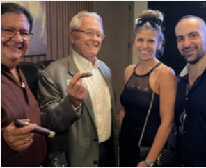
Chamber Connections: Cigar Night February 21