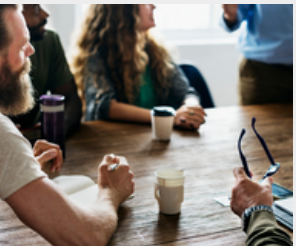
Member Orientation February 22