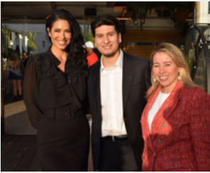
Chamber Connections February 15